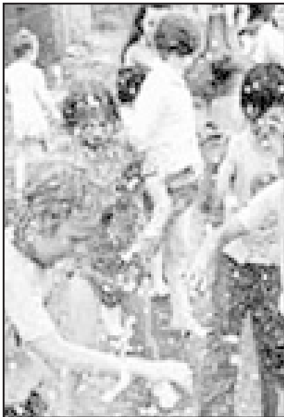
HOT: Young children cool off

naked for Cabinet, Chancellor Denis Healey chuckled: "They've been doing it at the IMF for years."